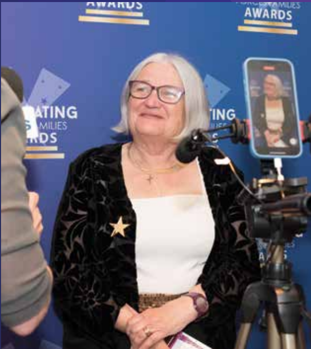
2022 Winner - Fun First

A CHARITY OR CIC WHICH HAS PROVIDED EXEMPLAR SUPPORT TO ARMED FORCES FAMILIES DURING 2022